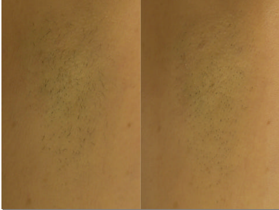
Figure 1. Two-week treatment interval photographs. Pre-treatment on the left, 12-month post-last treatment on the right.