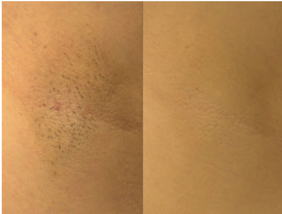
Figure 2. Six-week treatment interval photographs. Pretreatment on the left, 12-month post last treatment on the right.